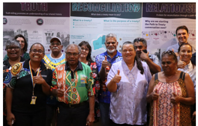
Mackay consultation session, November 2019.

“Treaty is like family, uniting everyone so everyone needs to be involved.” 190