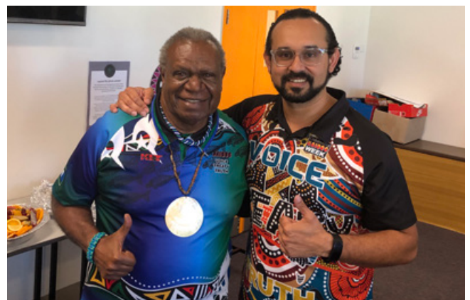
Thursday Island consultation session, November 2019.

“First Nations people need representation. A voice to raise our issues. It is impossible to make a treaty system suitable for the people if the people don’t have a say in its design.” 244