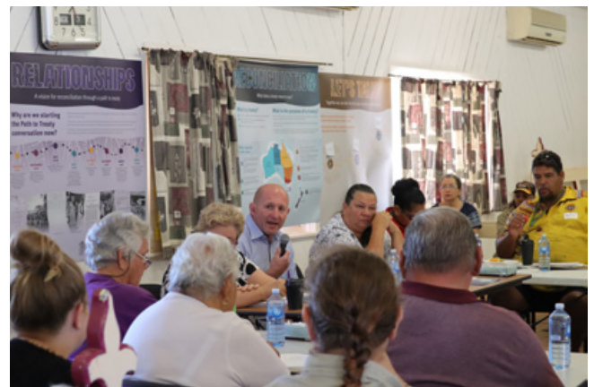
Cunnamulla consultation session, November 2019.

Many consider a treaty as a journey involving First Nations peoples, non-Indigenous Queenslanders, business, organisations and the Queensland government getting together to reach a point where they can sit down and negotiate ways for inclusive nation building.