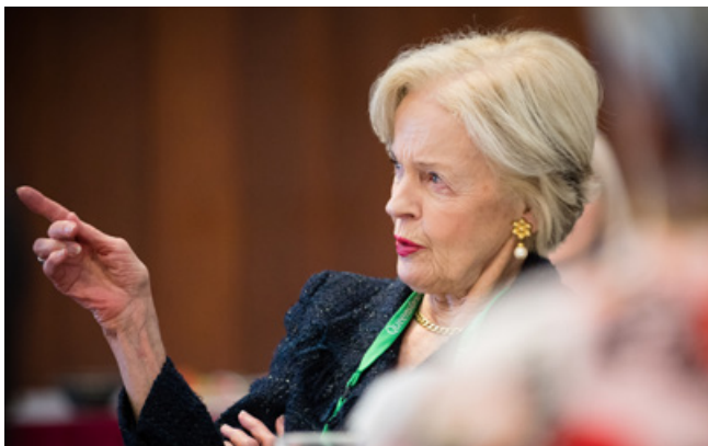
Hon Dame Quentin Bryce, Eminent Panel meeting, August 2019.