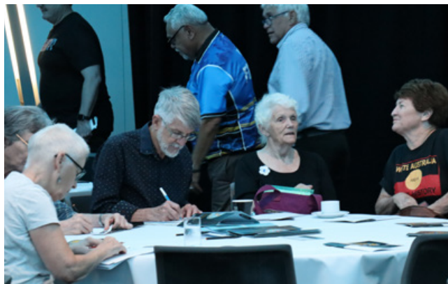
Brisbane consultation session, October 2019.