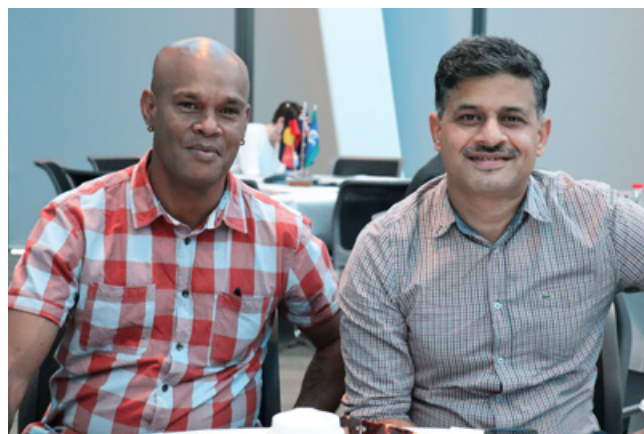
Brisbane consultation session, October 2019.

Non-Indigenous Australians stood up and overwhelmingly voted to change the Constitution to allow the Commonwealth to make laws for Aboriginal peoples. However, some non-Indigenous Queenslanders acknowledged that whilst the referendum in particular was an historic event, it did not ask much of non-Indigenous Australians and that a treaty offered an opportunity to contribute significantly to the reconciliation process. Some suggested specific steps that could be taken to mobilise participation from non-Indigenous people in a treaty process: