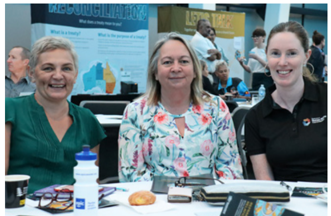
Brisbane consultation session, October 2019.

“The formation of a Congress to work together to, ‘unravel the acts’ on this, community by community.” 323