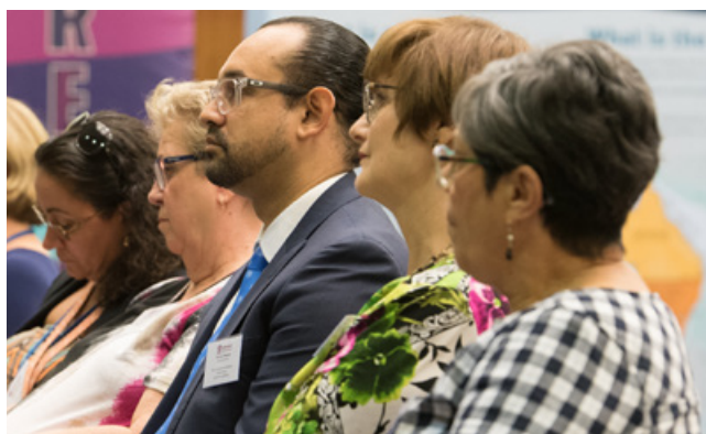
Handover of the recommendations report, February 2020.