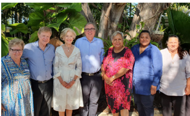
Townsville consultation session, October 2019.