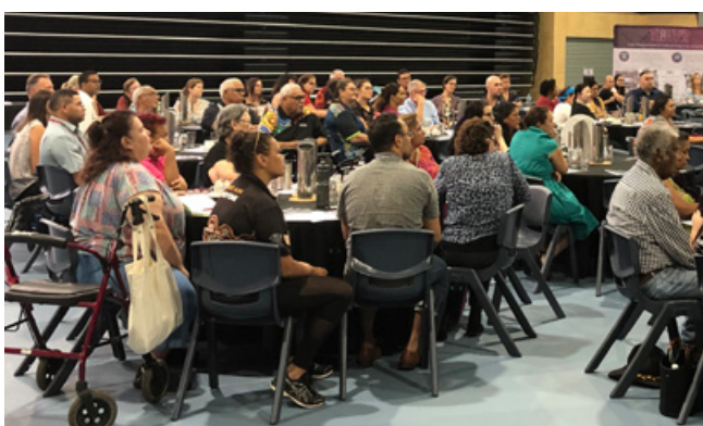
Caboolture consultation session, December 2019.