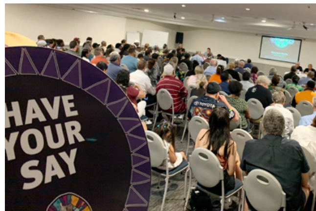
Cairns consultation session, October 2019.

“Treaty must include recognition of cultural authority.” 230